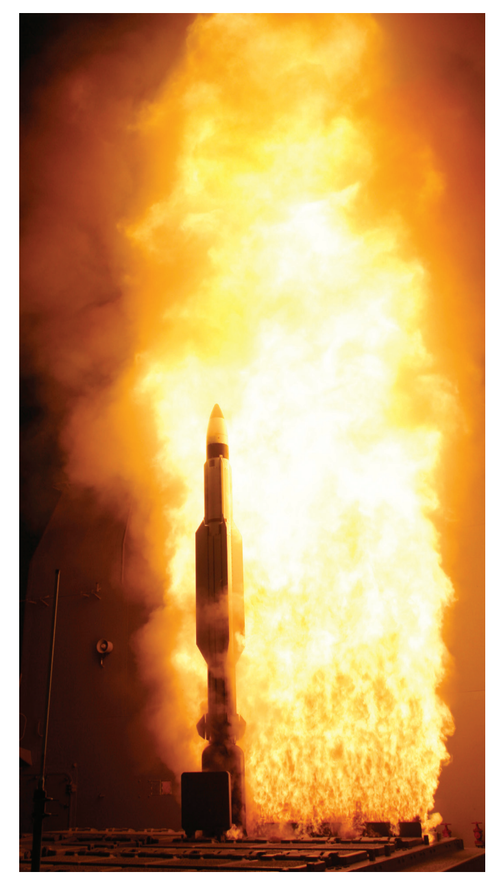
USS Lake Erie Missile test

This country has made useful investments before. With the political will, it could do so again.