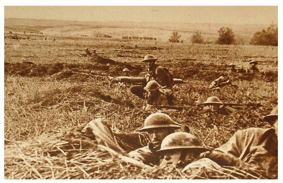
American troops in the field during World War 1

We've also largely forgotten, as the late Tom Hayden put it in his final book, Hell No. The Forgotten Power of the Viet nam Peace Movement , the "draft resisters, opposition among GIs, deserters to Canada and other countries, prayer vigils, moratoriums, letters written to Congress, civil disobedience,