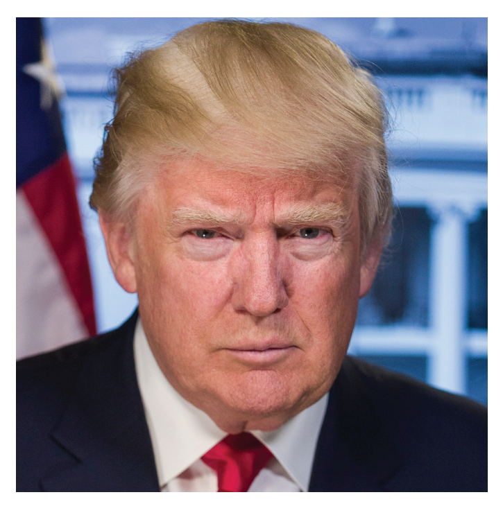
President Donald Trump's official portrait.

as fascist: Greece's Golden Dawn. Exploiting Greece's economic crisis and, especially, hatred of refugees and other migrants, Golden Dawn has used virulent nationalism and the supposed racial superiority of Greeks to emerge as Greece's third-largest party. Golden Dawn spokesman, Elias Kasidiaris, is known for sporting a swastika on his shoulder and for reading passages from the anti-Semitic hoax, the Protocols of the Elders of Zion , to parliament. The party also employs a swastika-like flag, as well as gangs of black-shirted thugs who beat up immigrants. Party leaders, in fact, are on trial for numerous crimes, including