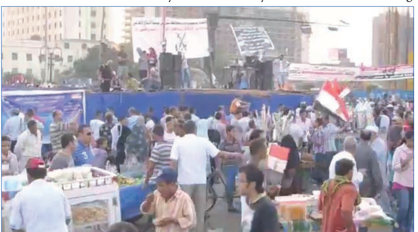
Tahrir Square, Cairo. July 15, 2011.

Instead of obsessing about the Muslim Brotherhood and Hamas and Hezbollah, what if we unilaterally, openly and enthusiastically focus instead on what Israel offers?