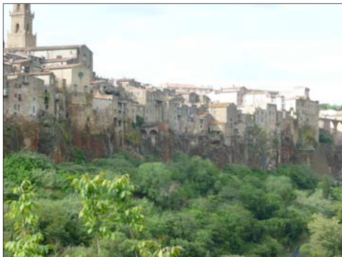
Pitigliano, in Tuscany, Italy. The town's synagogue is the third building on the left, with the round window.