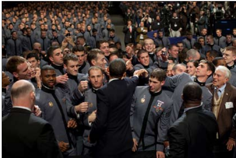
President Obama greets cadets following a speech at West Point Military Academy. “There’s something weird ... about the way when you talk to people about Obama, they mention his speeches and compare them to his other speeches. ... They talk about what he says and compare it what he says.”

remembered daily on right-wing radio. All the vehemence and animosity of the anti-Obama movement is concentrated now on handing him a defeat in this year’s midterm elections. Don’t do anything rash to jeopardize our victory — that is what the radio hosts say. (The Tea Party crowd, with their antitax, antidebt, antigovernment views, are regarded sympathetically by something between 20 per cent and 30 per cent of the voters; they know they are less than a groundswell but