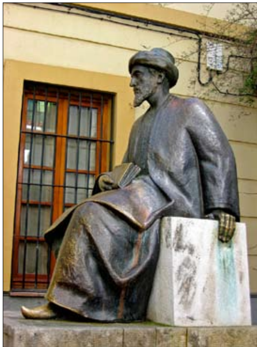
"Make it known to your students that Maimonides was Islamic civilization's gift to the Jews." Statue commemorating Maimonides' life and work in Cordoba, Spain.

2. Schools should invite Palestinian refugees to speak to students about their experiences. That would be a kiddush ha-Shem /sanctification of God's name in its own right, and the educational value would be enormous. I am not saying that equal time must be given to Palestinian spokesmen on the conflict. This is not about politics. It is about humanity and decency. Oscar Hammerstein wrote, "You've got to be taught to hate," but in a particularistic, religious atmosphere, and in the middle of a conflict, you have to be taught to respect. I realize that taking any time away from the curriculum for tikun olam is controversial, and trying to human-