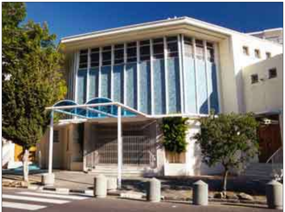
Green and Sea Point Hebrew Congregation, Cape Town.

For all my cringing at their blind support for military be-