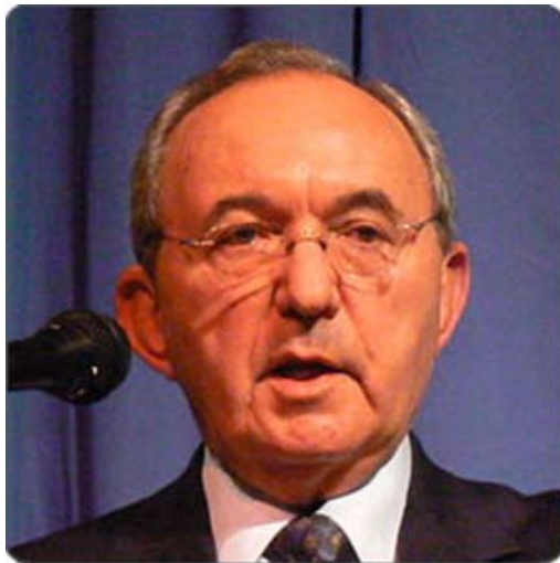
Justice Richard Goldstone, pictured in 2007, chaired the United Nations Fact-Finding Mission on the Gaza Conflict.

Our Zionism was taken for granted, but very private. Being a Jew meant loving Israel. End of story. My mother belonged to WIZO, the Women's International Zionist Organization. All I knew was that it had something to do with baking