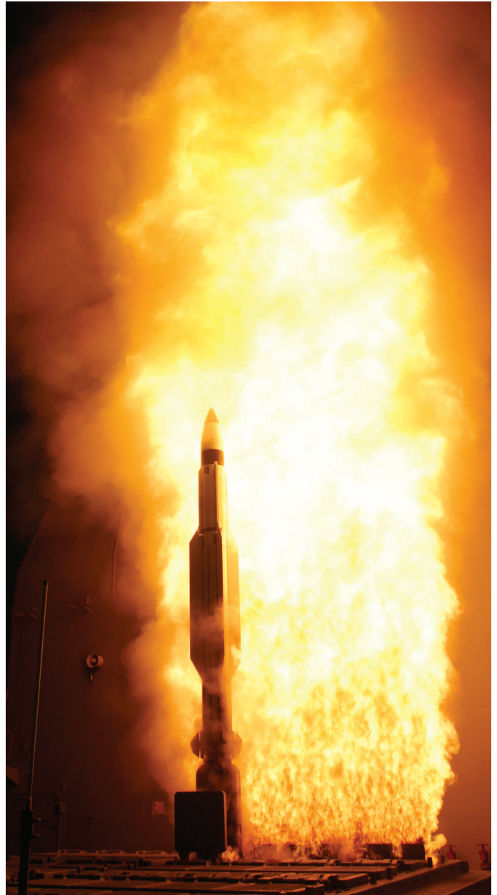
USS Lake Erie Missile test

This country has made useful investments before. With the political will, it could do so again.