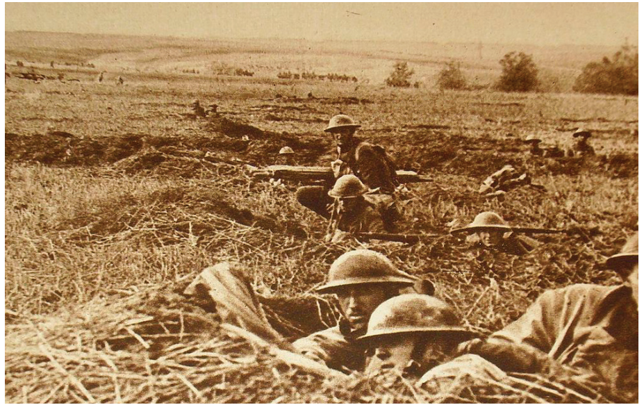
American troops in the field during World War I

We’ve also largely forgotten, as the late Tom Hayden put it in his final book, Hell No. The Forgotten Power of the Vietnam Peace Movement , the “draft resisters, opposition among GIs, deserters to Canada and other countries, prayer vigils, moratoriums, letters written to Congress, civil disobedience,