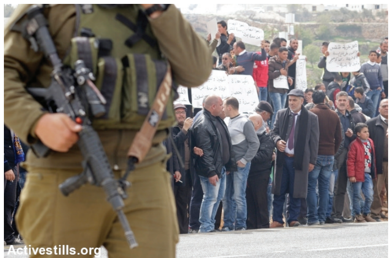
Protest against military closure, Qalqas, West Bank, 17.3.2017.