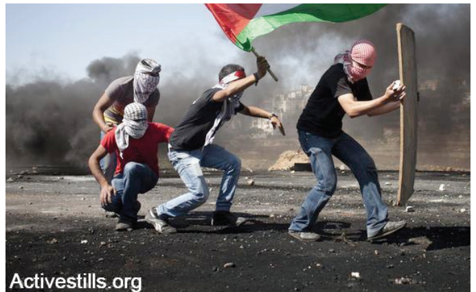
Nakba Day protest, Ofer military prison, West Bank, 15.5.2012.