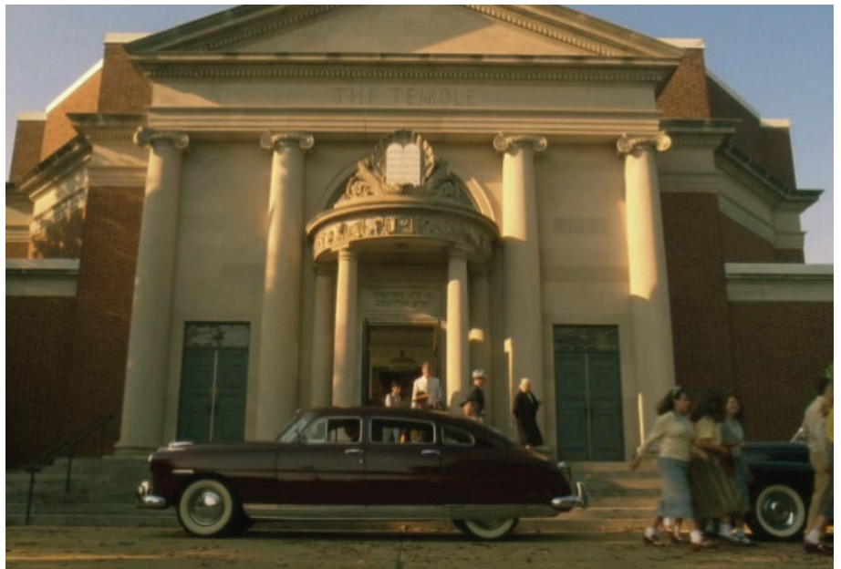
The Hebrew Benevolent Congregation on Peachtree Road in Atlanta, as featured in the 1989 film Driving Miss Daisy .

Driving Miss Daisy was written by Alfred Uhry (b. 1936), an Atlantan of German-Jewish descent. It forms part of his so-called "Atlanta Trilogy" of Jewish life; the other two parts are The Last Night of Ballyhoo (1996), about a Jewish