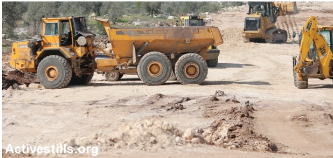
New settler road, Nabi Elias, West Bank, 6.2.2017.

Activestills has documented injustices in the unrecognized villages for almost a decade. On this occasion, photographers spent all night in Umm al-Hiran. Their pictures tell a very different story to the one given by the Israeli government. They show Odeh bleeding on the ground, Bedouins weeping in front of their destroyed houses, and the disproportionate might of the well-armed police forces. They are keeping their cameras trained on the Israeli administration. ✪