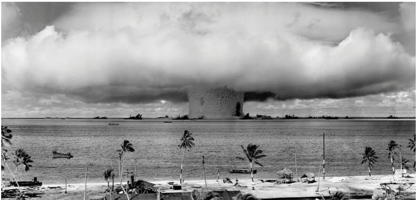
Atomic cloud during Baker Day blast at Bikini - NARA - 520714.tif