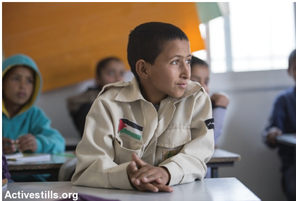
Khan Al-Ahmar, West Bank, 22.2.2017.