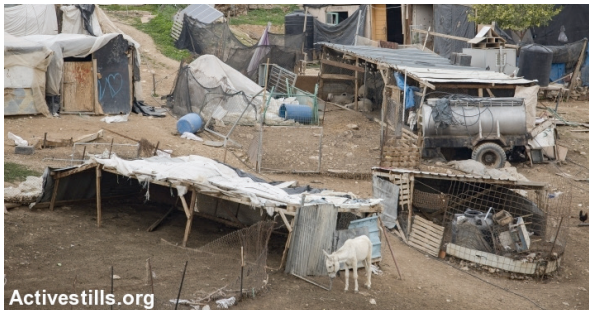
Khan Al-Ahmar, West Bank, 23.2.2017.